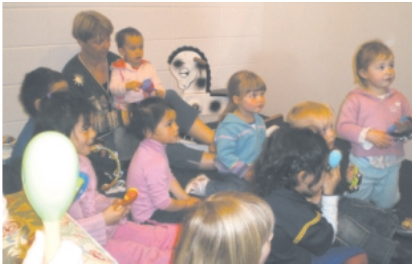
Enjoying mat time with friends at playgroup.